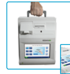
Portable and lightweight